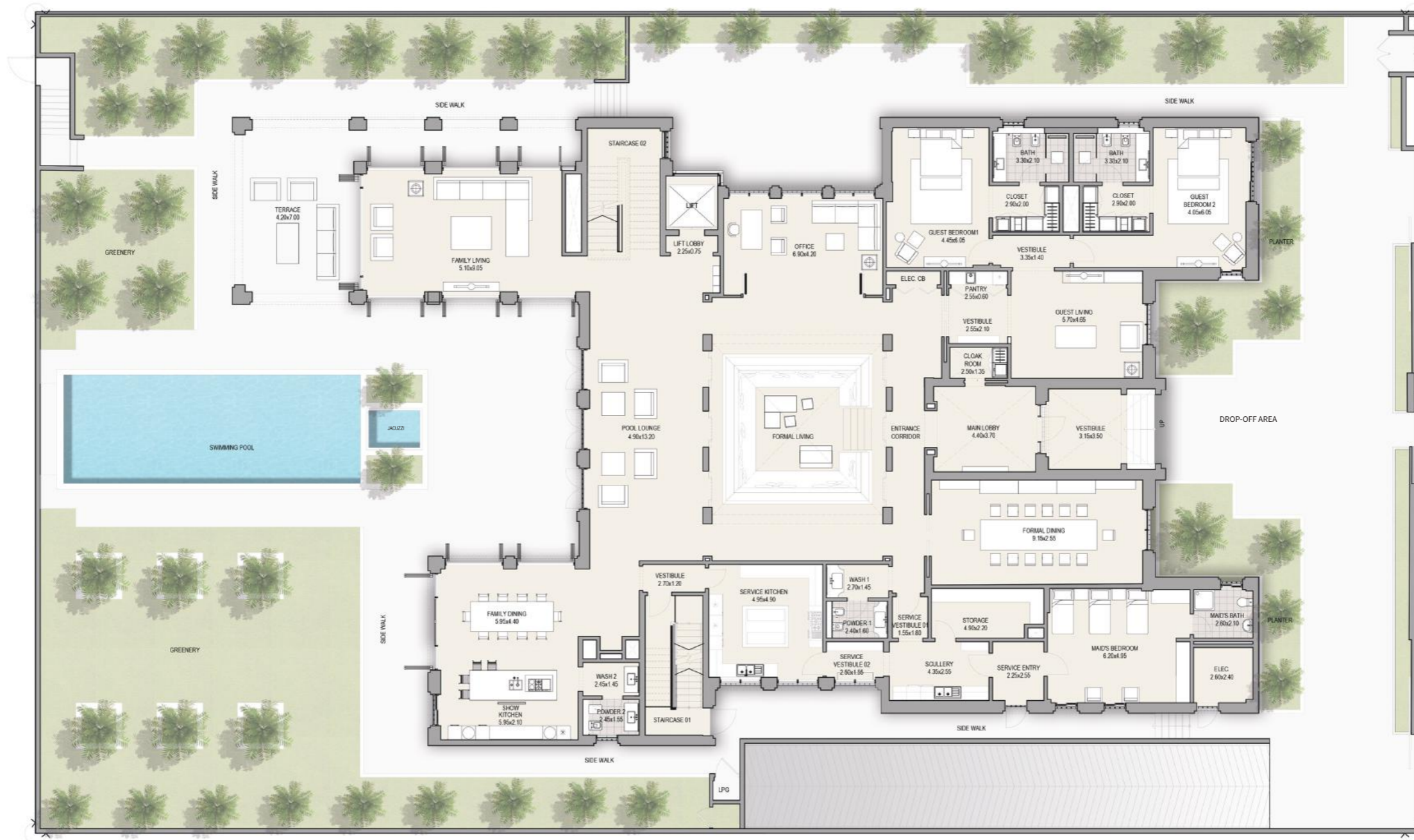
GROUND FLOOR TOTAL AREA 25,871 SQFT

Disclaimer: The trademarks, images and copyright included in this literature may not be used without the express prior written consent of District One FZ. All rights reserved. All reasonable care has been taken in the preparation of this literature and to the best of our knowledge, no relevant information has been omitted on purpose. However, District One FZ and its management, employees, appointment sales and marketing agents disclaim all liability in the event that any information, design, area or matter in this literature differs from the sale and purchase agreement or the actual constructed development or part of the development. None of the information contained in this literature should be reviewed as an offer to sell or as a solicitation to purchase any part of the development. Rather the information contained herein is provided to you as that you can learn and generally familiarise yourself with the development. We reserve our right to make improvements and/or changes to this literature and the information, design or areas contained at any time without notice or obligation.