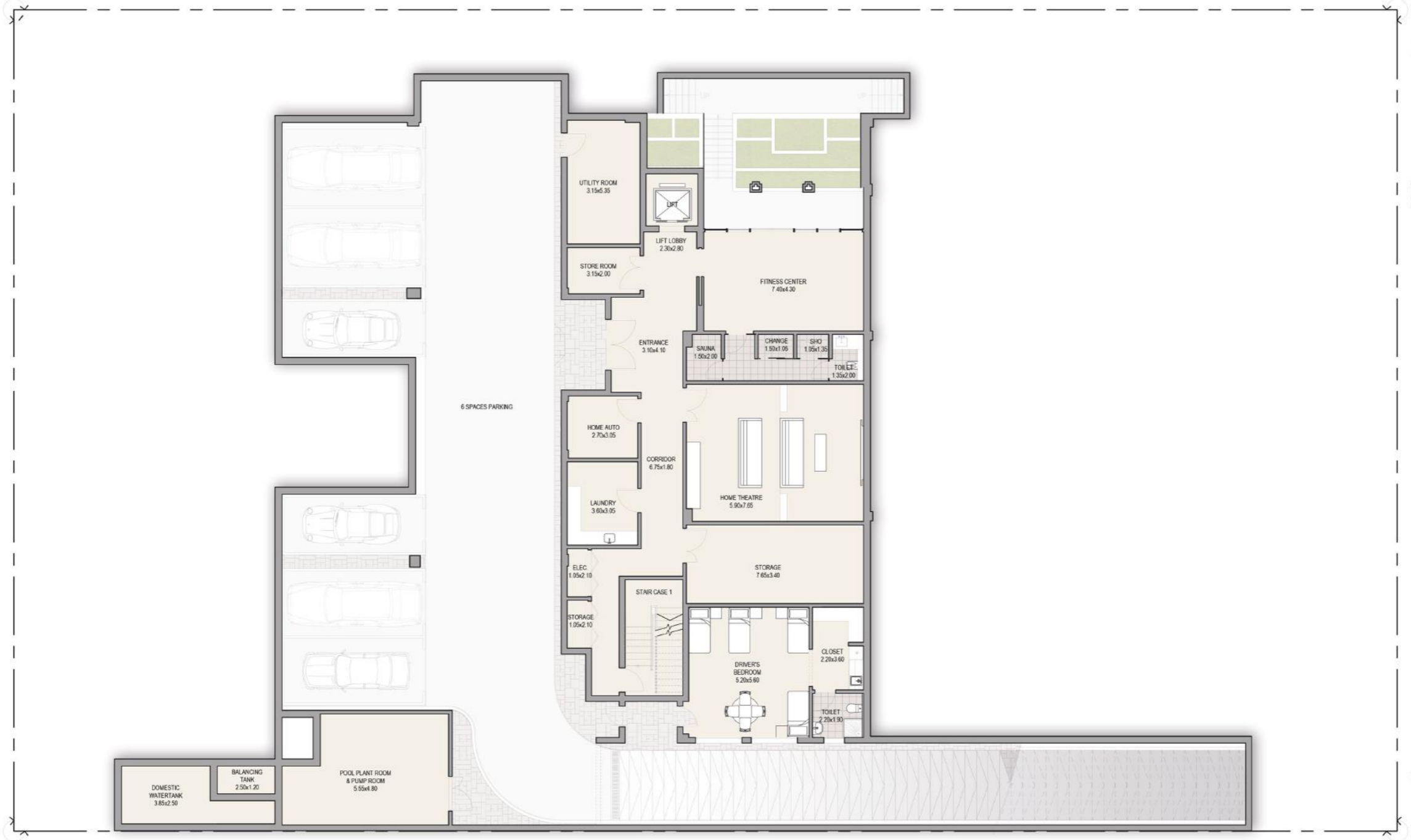
BASEMENT FLOOR TOTAL AREA 25,871 SQFT

Disclaimer: The trademarks, images and copyright included in this literature may not be used without the express prior written consent of District One FZ. All rights reserved. All reasonable care has been taken in the preparation of this literature and to the best of our knowledge, no relevant information has been omitted on purpose. However, District One FZ and its management, employees, appointment sales and marketing agents disclaim all liability in the event that any information, design, area or matter in this literature differs from the sale and purchase agreement or the actual constructed development or part of the development. None of the information contained in this literature should be reviewed as an offer to sell or as a solicitation to purchase any part of the development. Rather the information contained herein is provided to you as that you can learn and generally familiarise yourself with the development. We reserve our right to make improvements and/or changes to this literature and the information, design or areas contained at any time without notice or obligation.