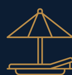
Crystal Lagoon & Beachfront